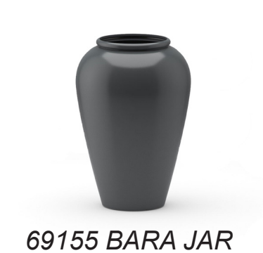
69155 BARA JAR