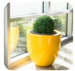
UV AND FROST RESISTANT